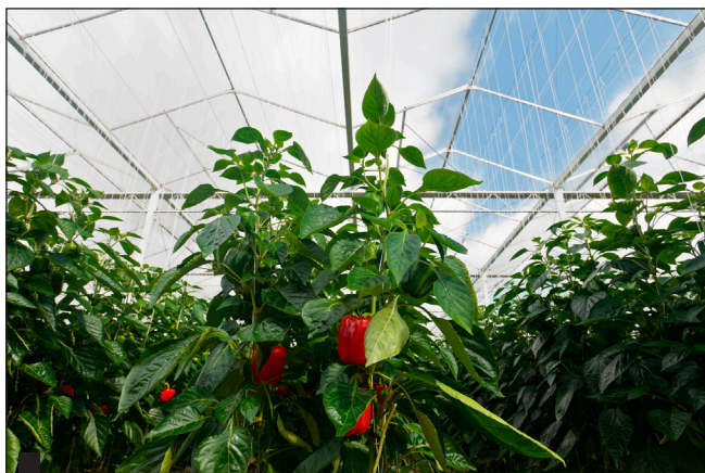
Fogging was so successful that OriginO uses for pepper crops as well.

“During days with too much light and high outside temperatures, we use the fog in order to release the stress of the plant. Rather than being on the edge of growing all the time, we found that the fog could help us make things a bit easier on the plant. It gives us consistent fruit