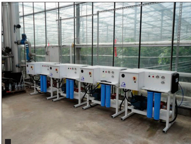
MicroCool IBEX pump units maintain constant relative humidity and cooling levels.

Fog can be used to humidify the environment to create optimal growing conditions when cold and dry or to add cooling as needed when temperatures climb to minimize plant stress.