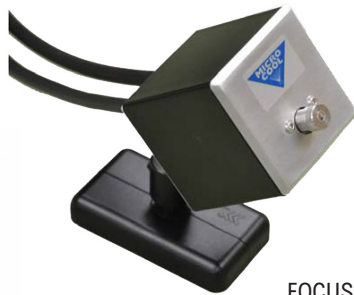
FOCUS Cube nozzle